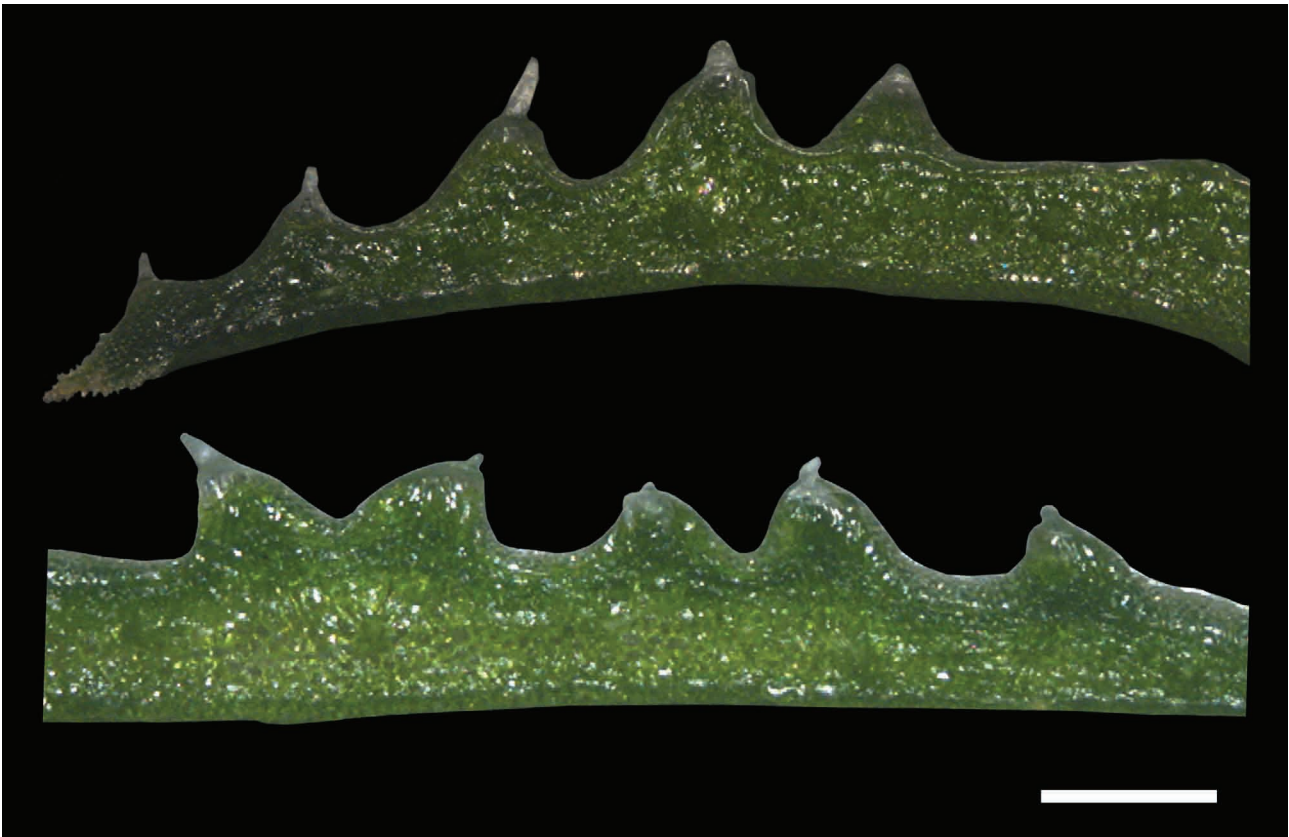
FIGURE 2. Leaf emergences of Massonia gypsicola Mart.-Azorín et al. Light microscope images. Scale bar: 1 mm.